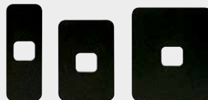
Cosmetic backplate covers